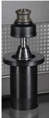
clamping device FIX-MATIC