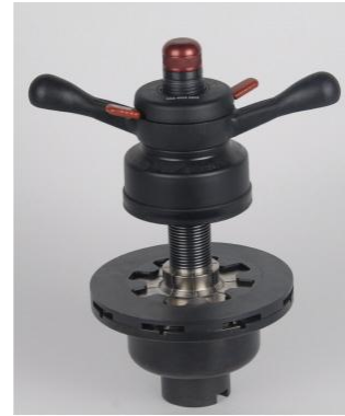
clamping device DUO-GRIP